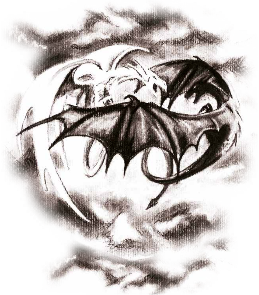
Red Dragon - Y Ddraig Goch