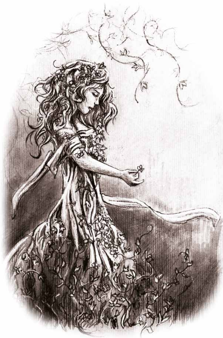
Maiden of the Meadows - Olwen