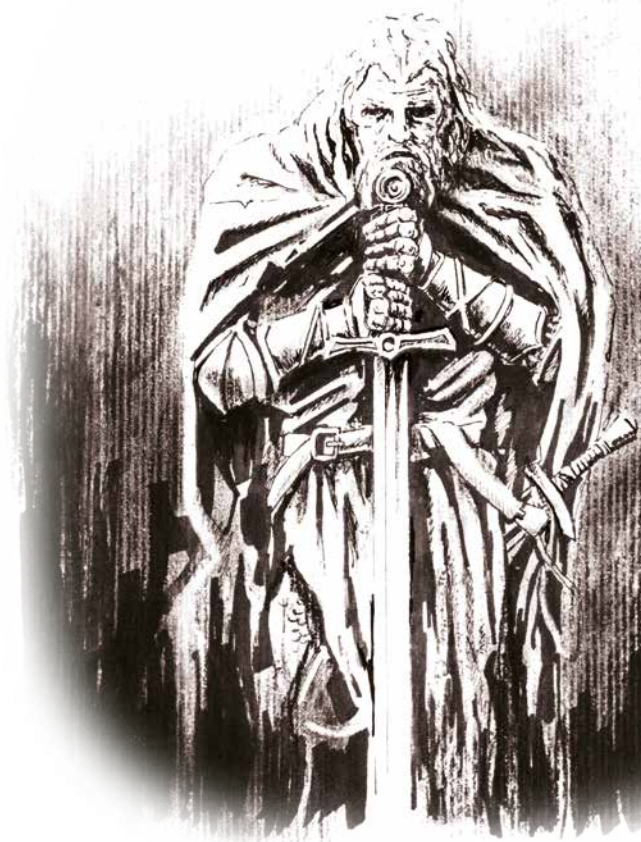
Ordained Knight - Peredur