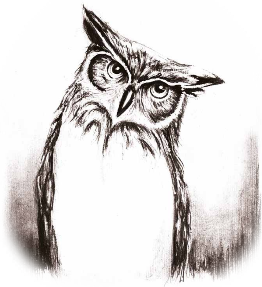
Llewellyn's Owl - Cwn Cawlwyd